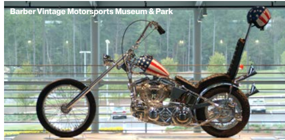
Barber Vintage Motorsports Museum & Park