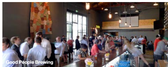
Good People Brewing