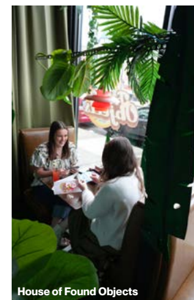
House of Found Objects