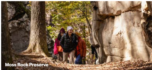
Moss Rock Preserve

You'll find it in Birmingham. Let us show you how to weave the wonders of nature, award-winning restaurants, history, arts, culture, and entertainment into one incredible day in the Magic City.