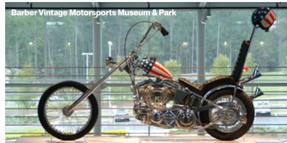
Barber Vintage Motorsports Museum & Park