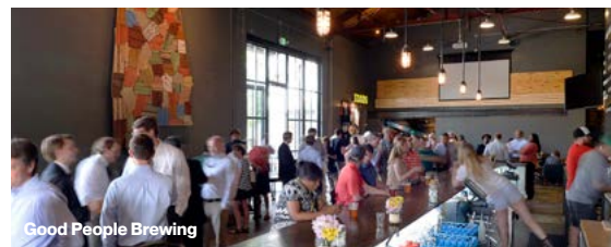
Good People Brewing